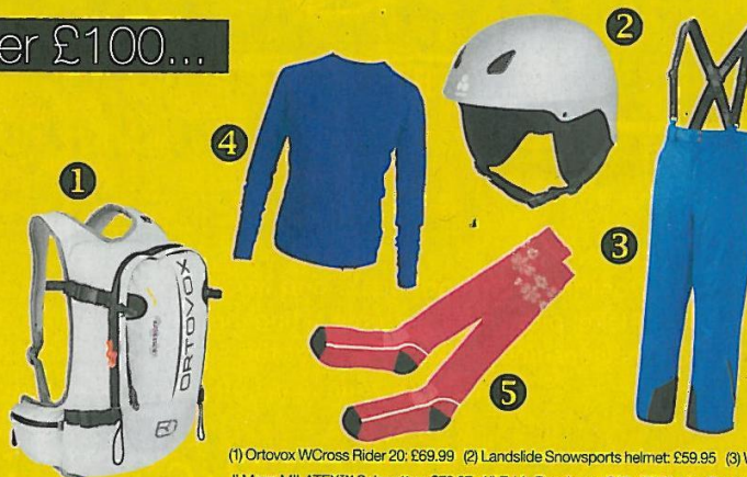
(1) Ortovox WCross Rider 20: £69.99 (2) Landslide Snowsports helmet: £59.95 (3) Wildcat II Mens MILATEX™ Salopettes: £79.97 (4) Eddy Baselayer: £40 (5) Woolen Socks: £7

..... Check out goodskiguide.com for more stylish skiwear